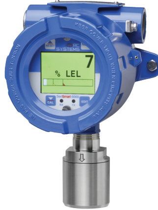
SenSmart 6500 AL