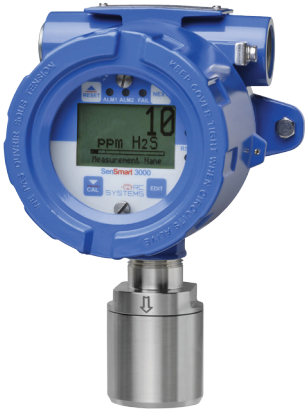
SenSmart 3500 AL