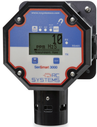
SenSmart 3500 PY