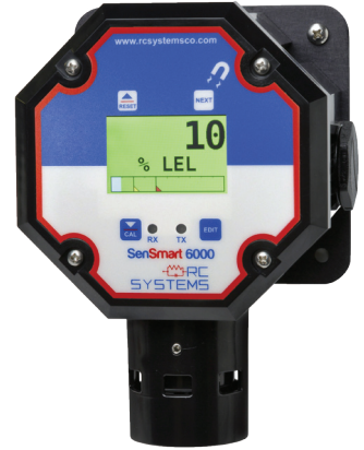
SenSmart 6500 PY

Volatile Organic Compounds (VOCs) are potentially dangerous compounds, created by industrial and natural processes, which vaporize under normal atmospheric conditions. Benzene is an especially dangerous and widely used VOC requiring detection in many industries. A PID (Photoionization Detector) is the easiest and most efficient way to detect Benzene and other VOC levels. Although not as selective as much higher cost analyzers, the R. C. Systems Inc. SenSmart 3500 and SenSmart 6500 fixed PID gas detectors provide real time PPM readings to enable users to react swiftly to potential threats without waiting for a time-weighted average (TWA). Also ask about our process cell and sample systems.